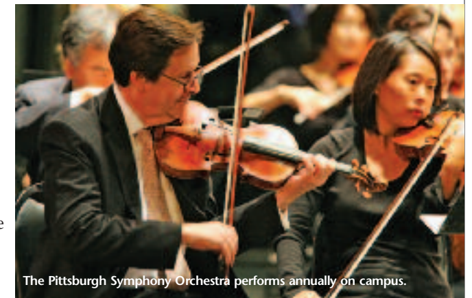
The Pittsburgh Symphony Orchestra performs annually on campus.

Forging world-class affiliations has been a longtime endeavor at California University. The foundation was laid more than 15 years ago, when first