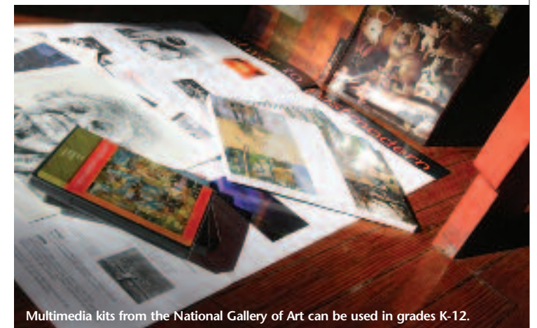
Multimedia kits from the National Gallery of Art can be used in grades K-12.

The program supports our goal of bringing cultural resources to