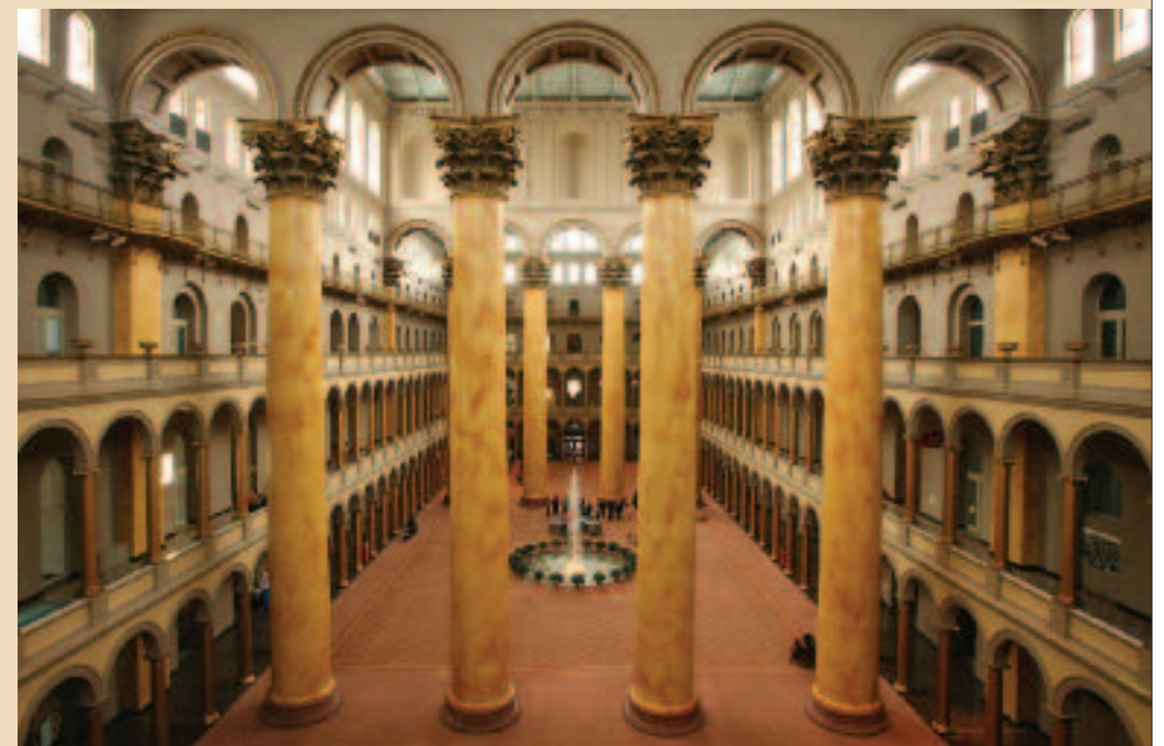
The National Building Museum in Washington, D.C.