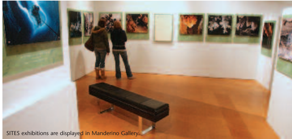
SITES exhibitions are displayed in Manderino Gallery.

In the mid-1990s, the only gallery space on campus was in Reed Library, a 30-year-old building ill-suited for housing expensive and irreplaceable artworks.